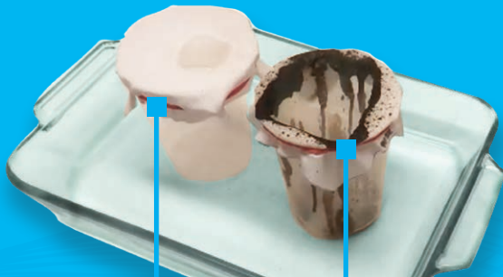
100% POLY WITH MILLIKEN® SHIELDCSR™

medium to high surface tension and medium to high polarity. CP fabric is not as effective with chemicals that have medium to low surface tension and medium to low polarity. The user should check the properties of their liquids and test with Bulwark CP fabric to be sure the fabric works properly.