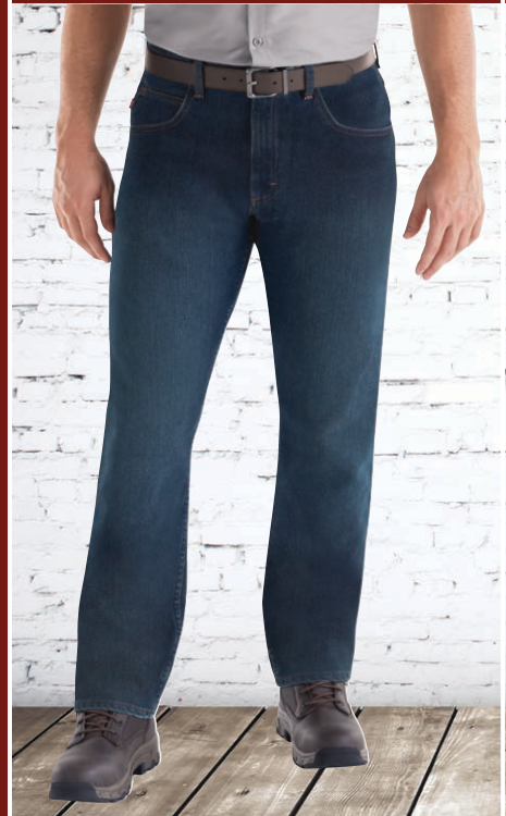
PD90 - 5-Pocket Styling