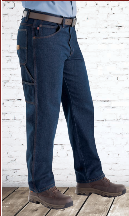
PD80 - Carpenter Styling